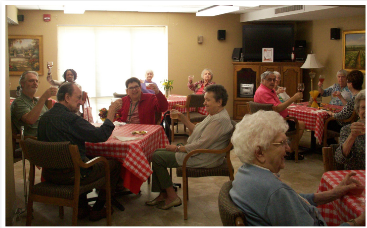
Cin cin! Everyone had a lovely time — viva Italia!