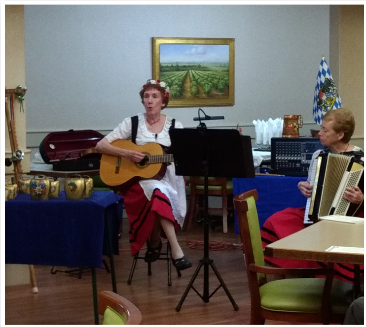
Oktoberfest was so much fun. These ladies are great! Make sure you come out to our next event.