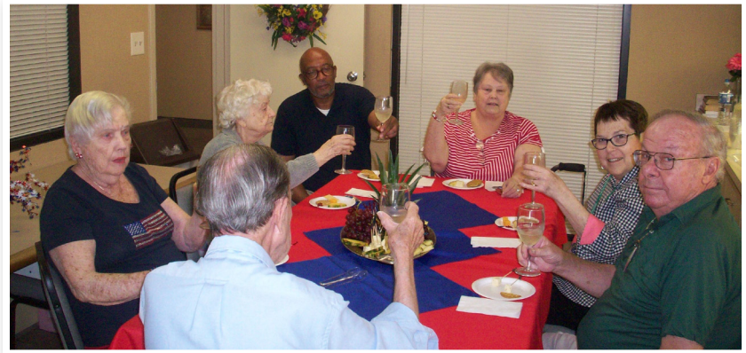
We had a wonderful time at the Wine and Cheese Tasting. Be sure to join us at the next one.

“Americans are getting stronger. Twenty years ago, it took two people to carry ten dollars’ worth of groceries. Today, a five-year-old can do it.” — Healing Through Humor