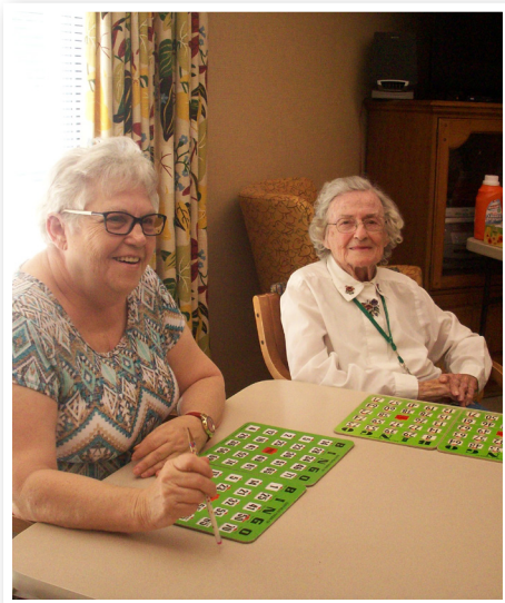
Don't forget to join us every Tuesday for Prize Bingo at 1 p.m.