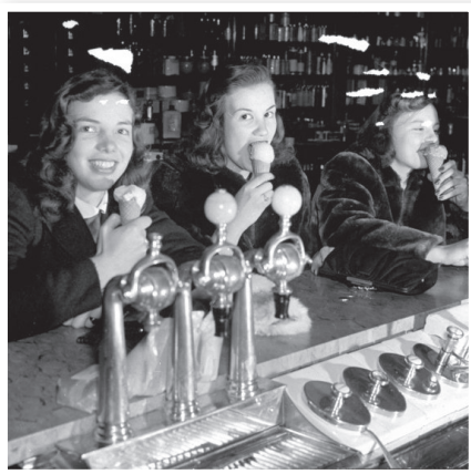
July is National Ice Cream Month! Did you know in 1984 President Ronald Reagan designated July to be National Ice Cream Month?